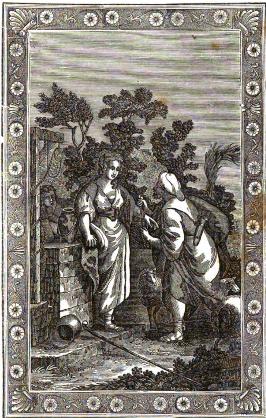
ABRAHAM'S SERVANT MEETING REBECCA AT THE WELL.